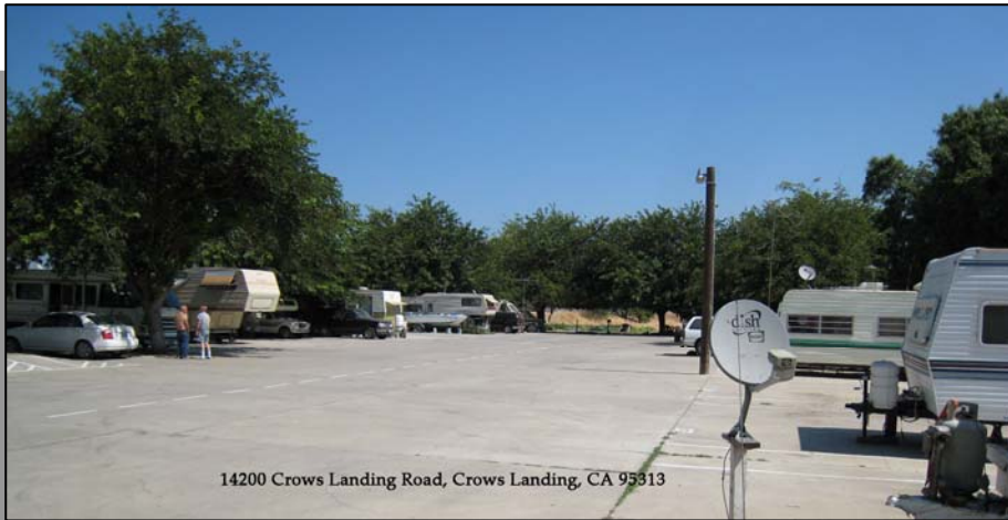
14200 Crows Landing Road, Crows Landing, CA 95313