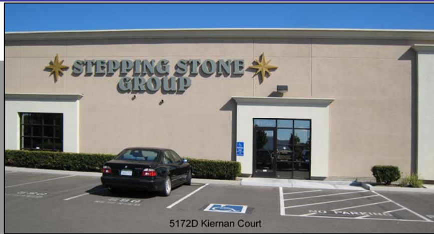
5172D Kiernan Court, Salda, CA