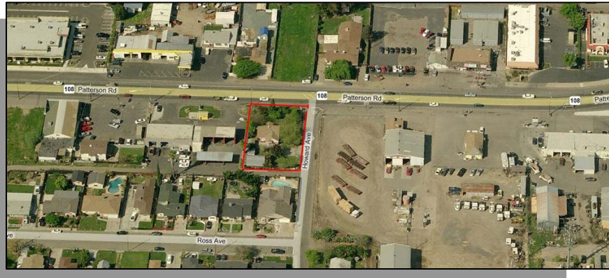
2666 Patterson Road, Riverbank, CA