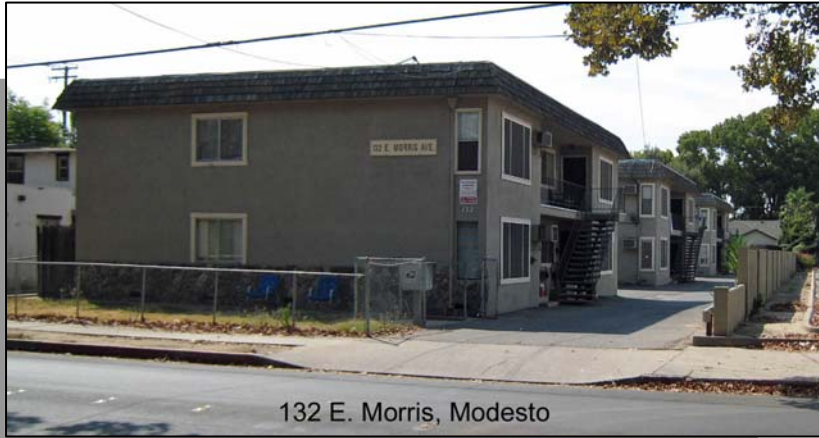
132 E. Morris, Modesto