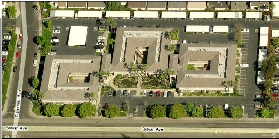
1101 Sylvan Ave., Modesto, CA Sylvan Office Park