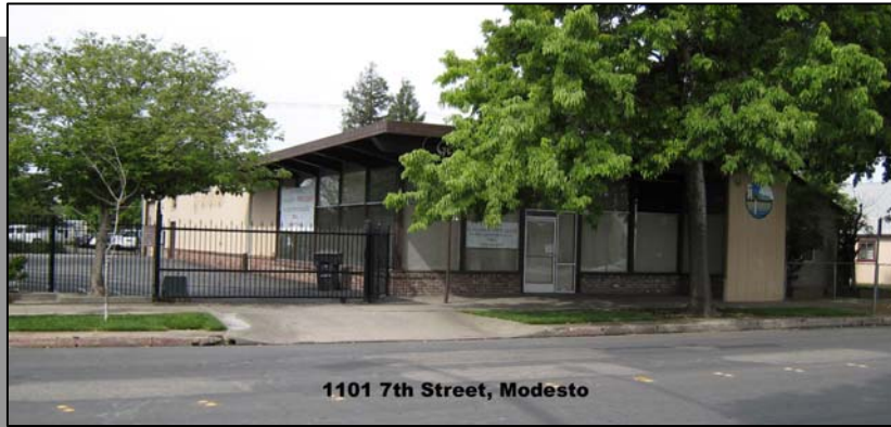
1101 7th Street, Modesto